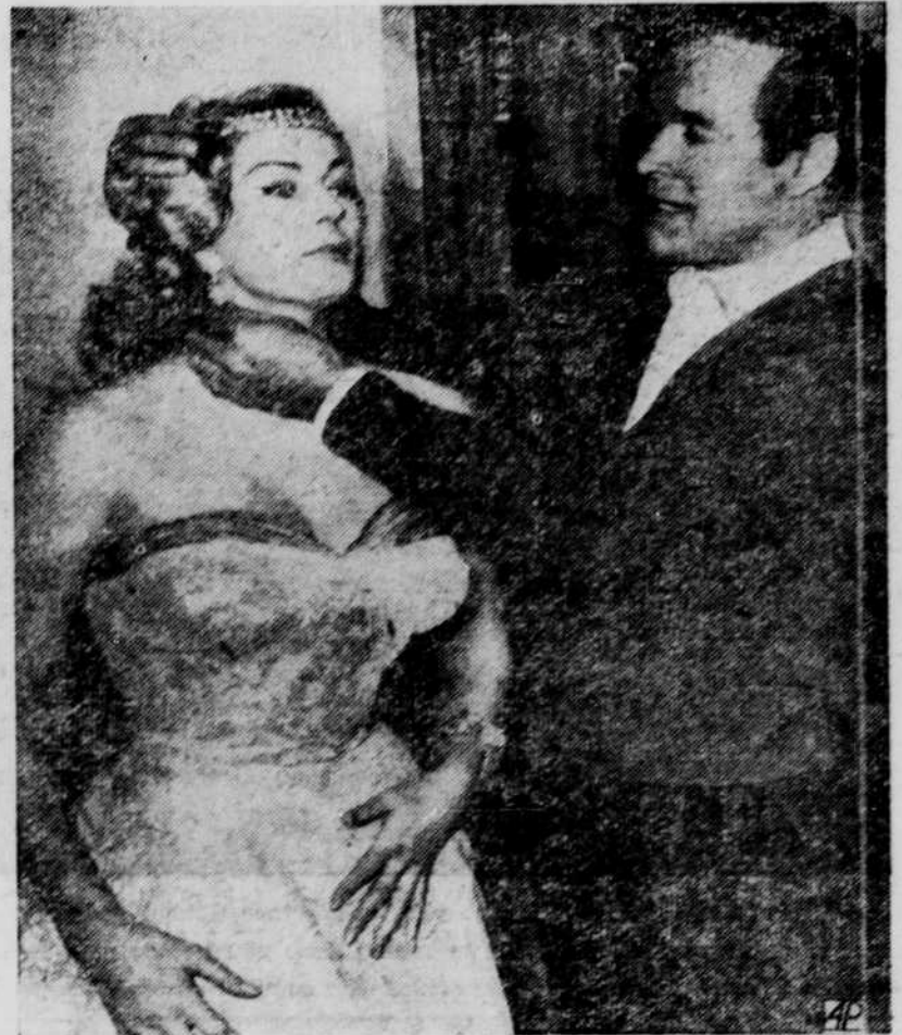
BOB HOPE helps Swedish actress Anita Ekberg try on bracelet, ear rings and tiara she wore at the Paris world premiere of the film "St. Joan." Hope and Miss Ekberg are making a movie in the French capital.