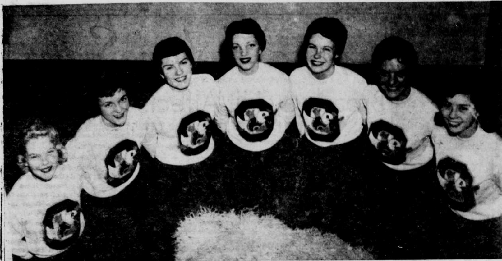
OREGON'S RALLY GIRLS will dance this weekend for the last time until next year's football opener as the Ducks play a pair of basketball games with Oregon State. To be seen at Corvallis to-