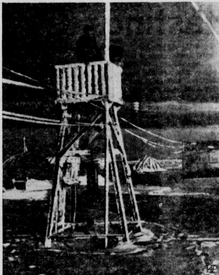
MOVING POST—Soviet scientist stands in tower, part of observation station on ice floe in northern Polar seas. Station has drifted more than 1,250 miles since its inception.