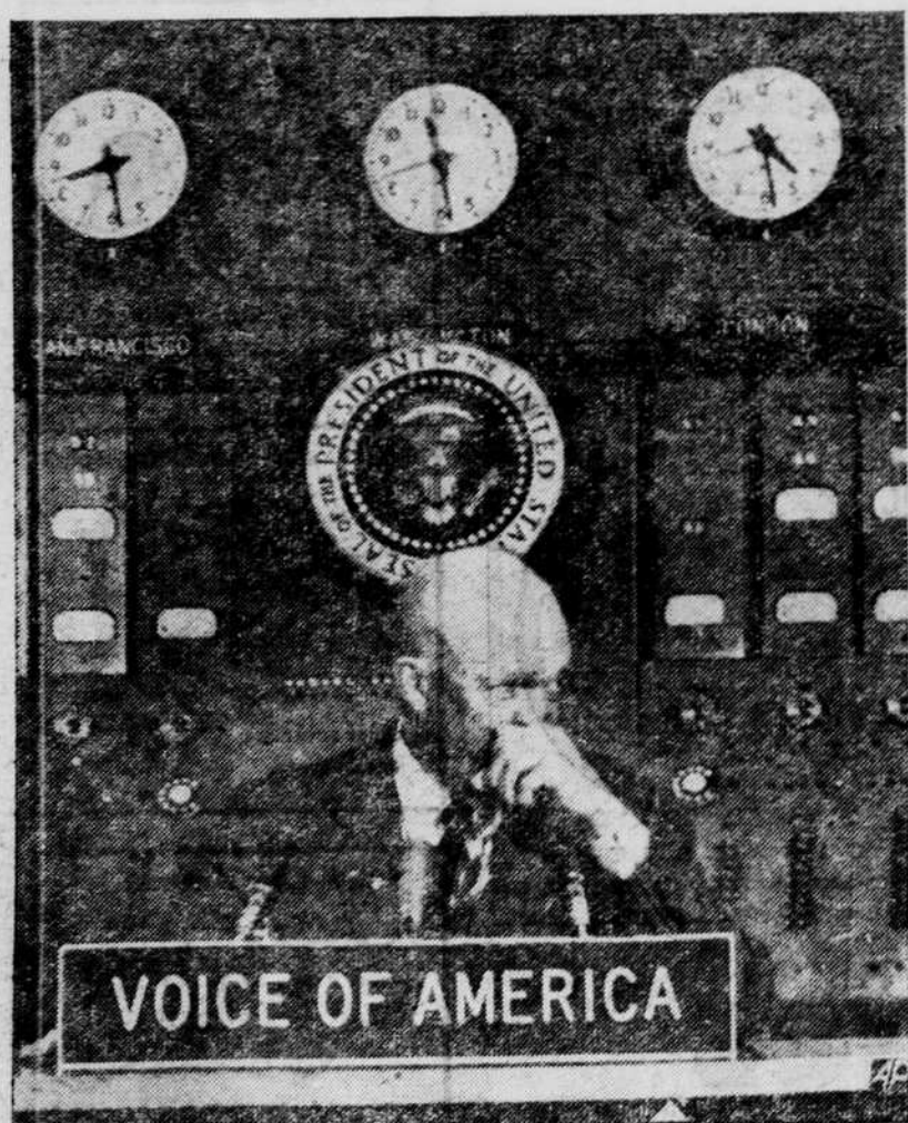
PRESIDENT ON 'VOICE' PROGRAM—President Eisenhower sits with his hand to his face in Washington, D.C., Feb. 25, just before beginning a world-wide radio broadcast marking the 15th year anniversary of the Voice of America. In his broadcast, Ike told the Middle East nations the menace of international Communism "could smash all their hard won accomplishments over night."