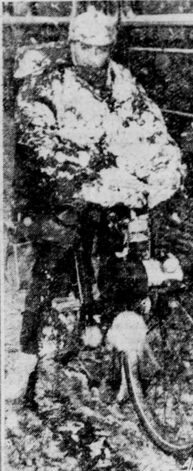
CHERI, IT'S COLD OUTSIDE—French cyclist wears mantle of snow over his poncho as snow storm swept the French capital Feb. 22. Unusually severe winter, coupled with the Suez-caused fuel shortage, has caused discomfort in France this year.

Rush Inn FINE FOODS Quick Courteous Service ON THE CAMPUS 854 E. 13th