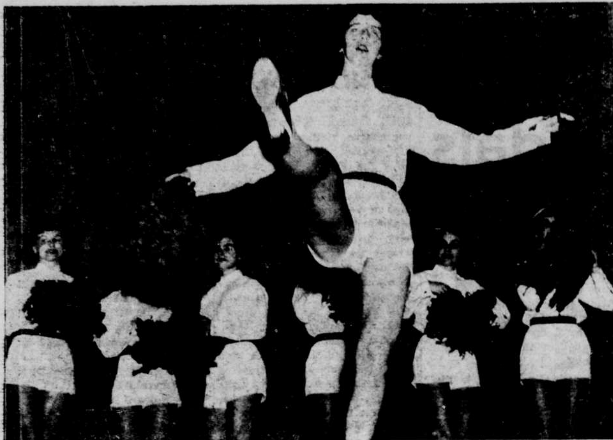
DELTA DELTA DELTA PLEDGES give it the "old college try" as they let go at the AWS Auction Friday. Men's living organizations bought the five sorority pledge classes, with the proceeds to go for scholarships.