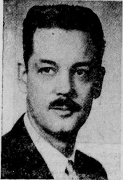
CHANCELLOR RICHARDS Given Top Position

The advisory group to the Department of State is composed of over 100 educators, scientists and