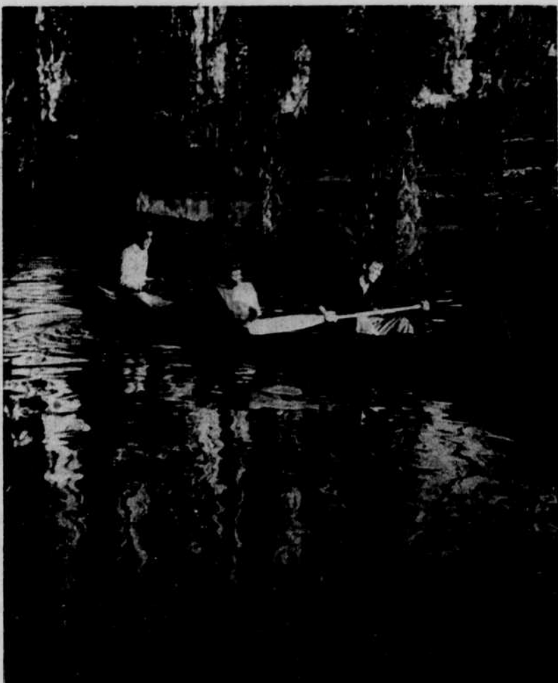
FRESHMEN WILL FIND a new experience awaiting them when they take a leisurely canoe ride down the millrace. Canoes may be rented at the boathouse on the millrace today from 3:30 to 7 p.m., Saturday from 1 to 7 p.m., and Sunday from 1 to 7 p.m. Canoe rental rates are 60 cents an hour.