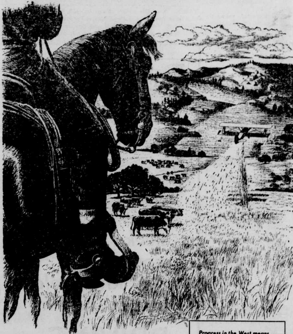
Broadcasting of Standard's new uniform chemically blended plant food by airplane can turn sparse hilly acres into rich pasture for livestock

RICHER SOIL means better crops, yet the West has never had enough soil-building fertilizer. To help meet farmers' needs, Standard opens a $16 million plant next month which will produce petroleum-derived plant food* in pellet form for Western soils and crops.