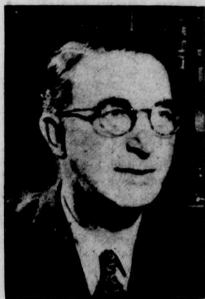
ESTES KEFAUVER Speaks in Springfield