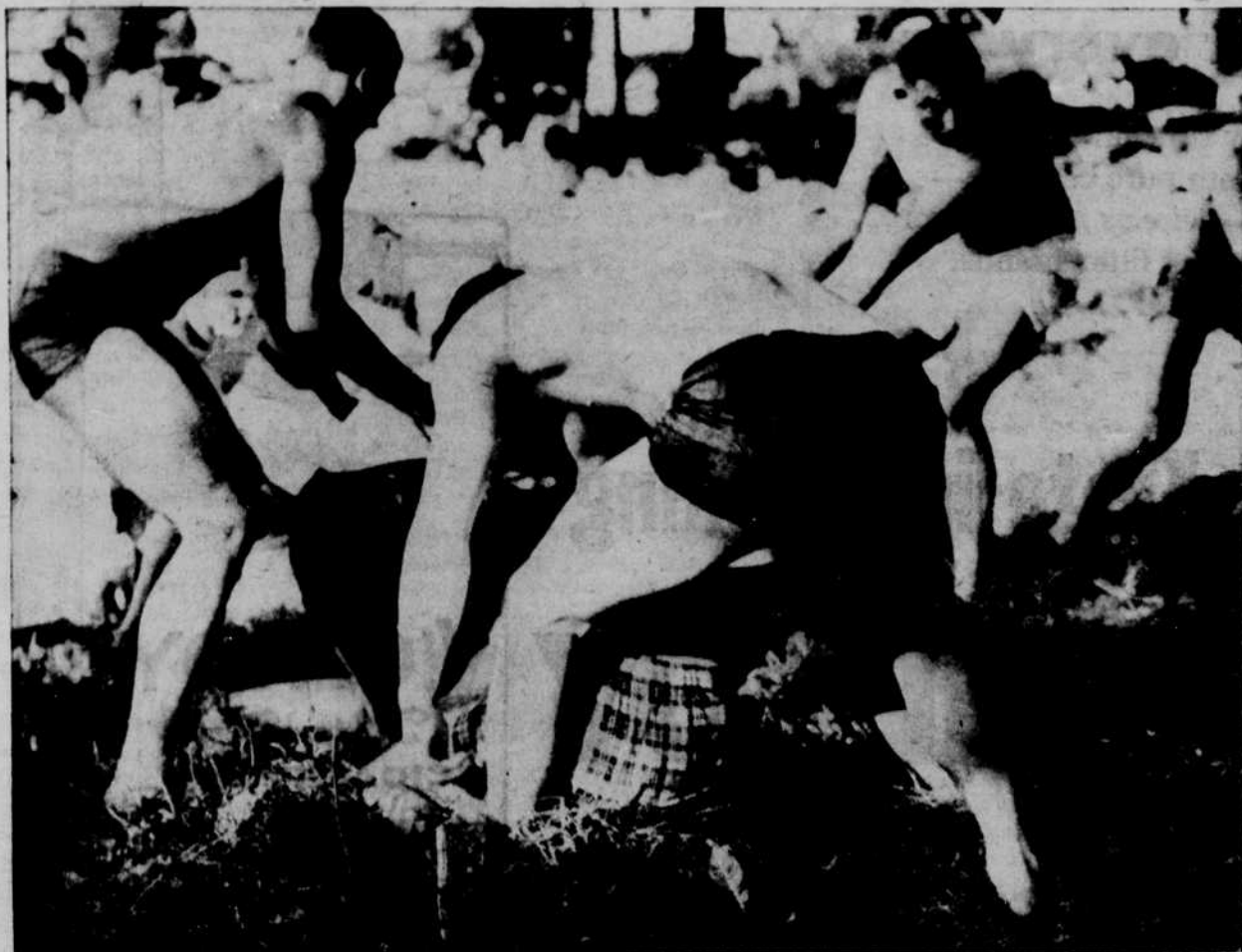
FRESHMEN STRONG MEN give a strong tug the rope at Thursday's tug of war with sophomore men. The frosh managed to win the contest, but just about everybody got wet.