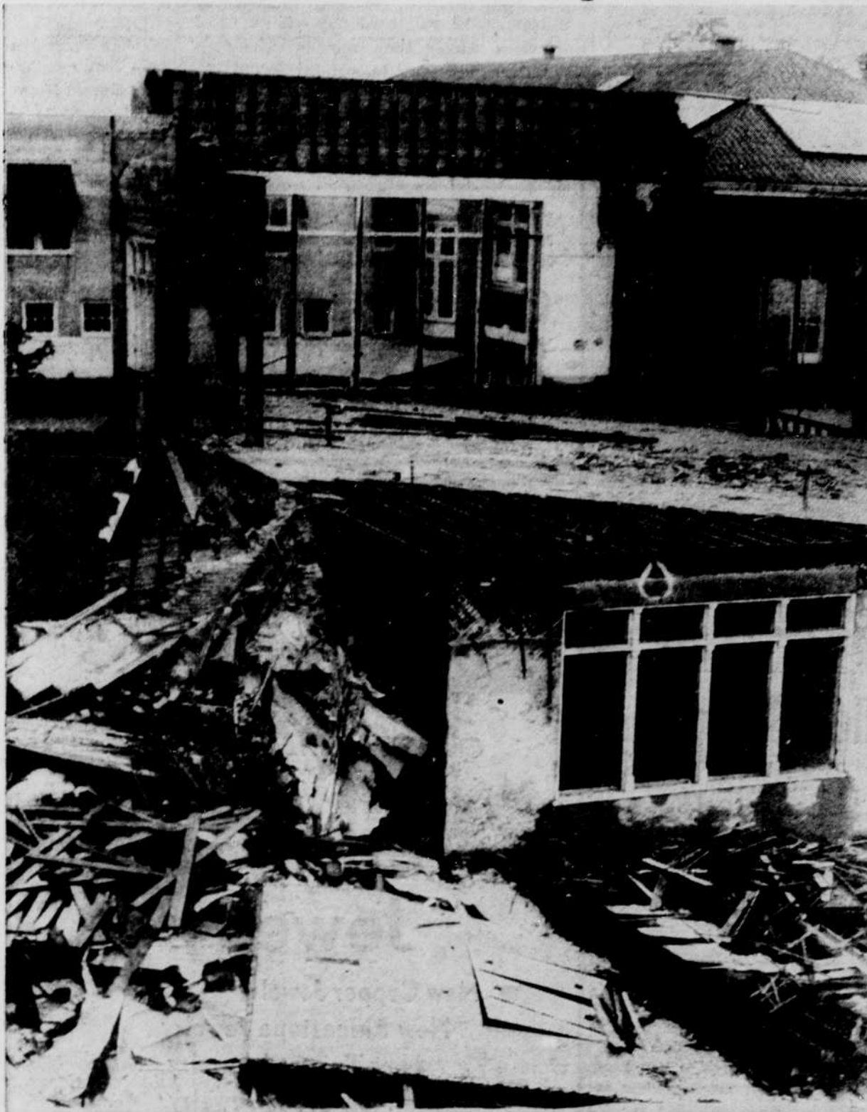
ONLY A SKELETON remains of the south wing of the architecture building, as workmen raze the old structure. Construction on the new building will begin in February, 1956.