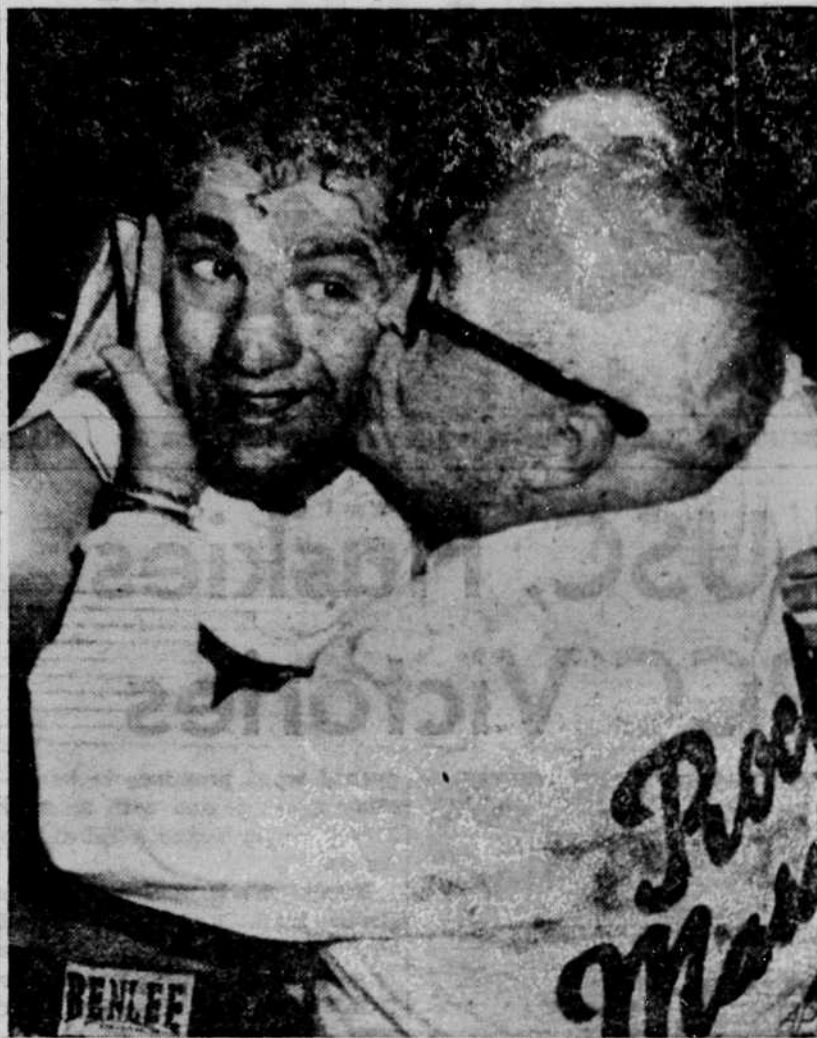
"That's my boy," says Al Weill, manager of heavyweight champion Rocky Marciano, as he gives his fighter a good-luck sendoff before his Tuesday night fight with light-heavyweight king Archie Moore. The 15-round bout will take place in Yankee stadium and will be carried by radio and closed television circuit tonight beginning at 6:30 P.S.T.