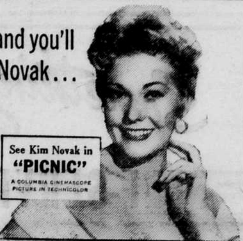
See Kim Novak in "PICNIC" A COLUMBIA GEMASCOPE PICTURE IN TECHNICOLOR