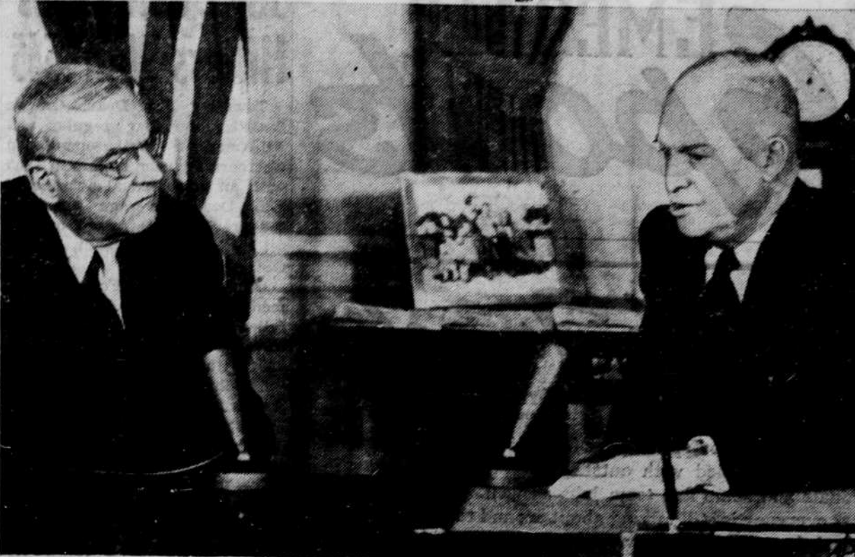
AS SECRETARY OF STATE John Foster Dulles cocks his head to listen, President Eisenhower talks on hopes for a new relationship with Russia since the signing of the agreement on Austrian independence. With cabinet members present, Eisenhower and Dulles talked informally from the President's White House office prior to a report to the American people on his missions last week to Paris and Vienna.