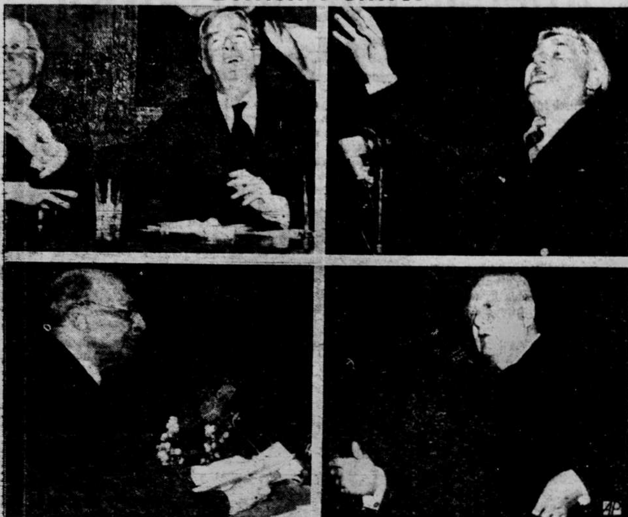
LEADERS OF BRITAIN'S incumbent Conservative party and Labor opposition go into high gear as the general elections near. Conservative standard bearer, Prime Minister Sir Anthony Eden, and Labor's left-wing orator, Aneurin Bevan, left to right above, gesture in recent campaign appearances. Labor leader Clement Atlee and Conservative ex-Prime Minister Sir Winston Churchill, left to right below, old political opponents, still face each other on opposite sides of the political fence.