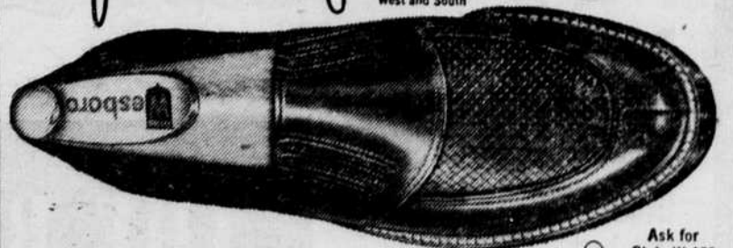
Ask for Style W-699

Add spice to your life with a swank variety of new spring and summer shoes to fit every occasion—everyday, dress-up and casual.