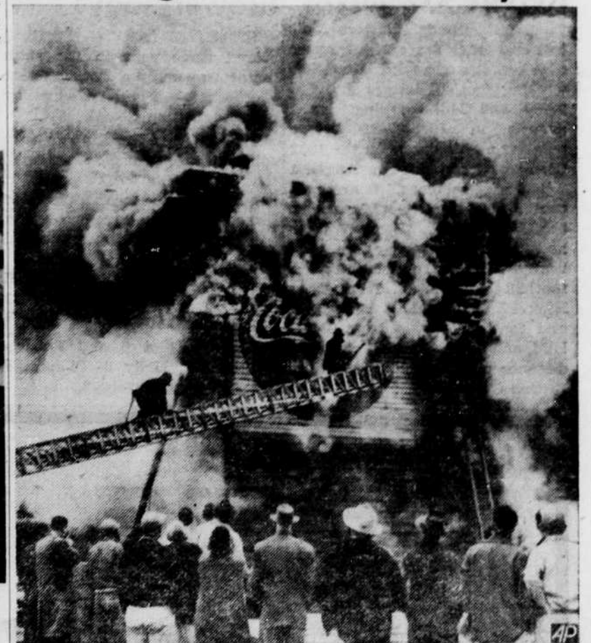
FIREMEN BATTLE FLAMES early Tuesday which engulfed this four story frame structure in Tacoma, Wash. Two persons were suffocated, about 12 persons, some in their nightclothes, fled to safety. The entire interior of the building was destroyed.