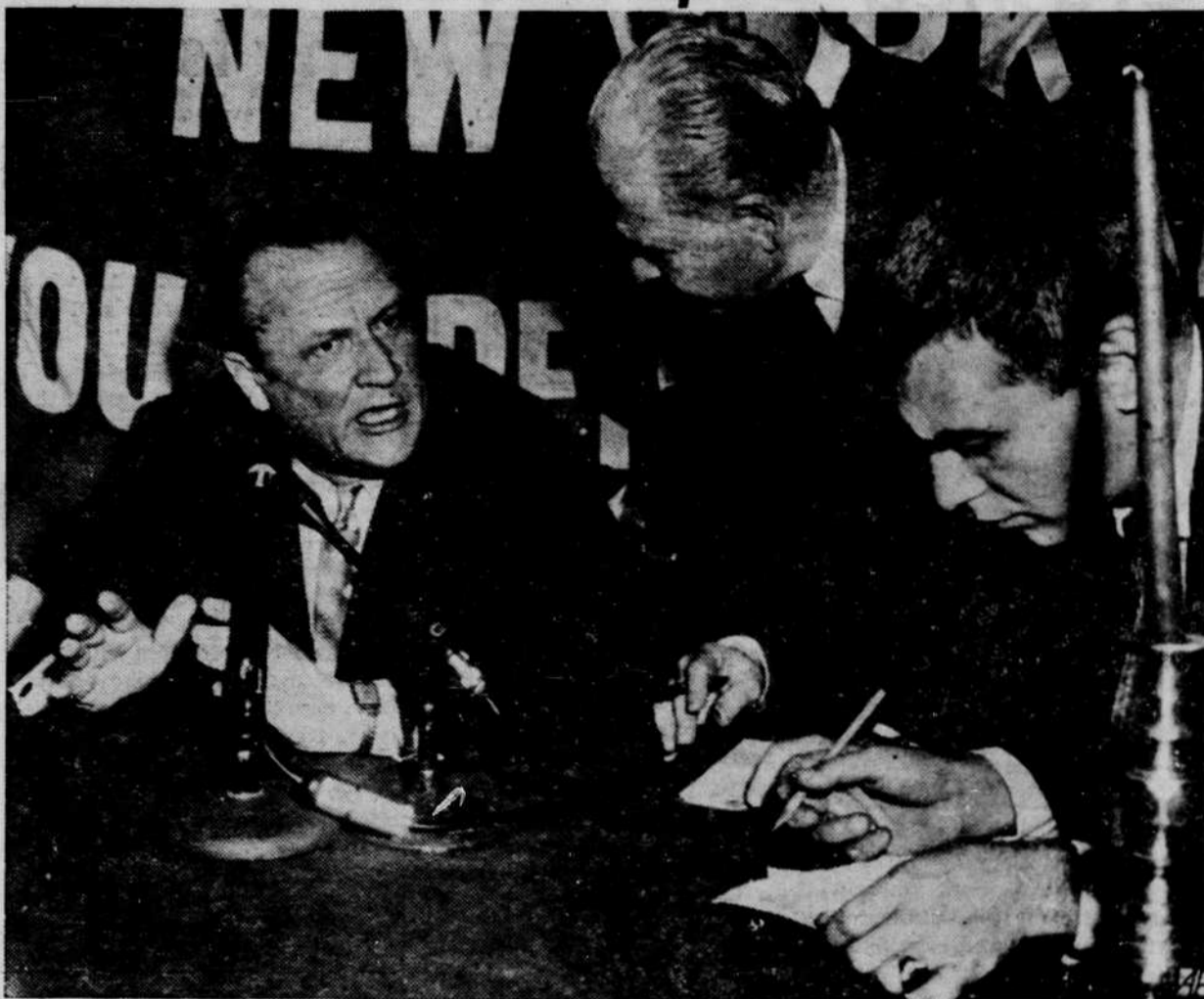
SENATE MINORITY LEADER William F. Knowland (Rep.-Calif.) talks with newsmen Monday before addressing annual dinner of the Young Republican club. In his talk he suggested that the Chinese mainland be divided at the Yangtze river for a period of 10 years with Nationalists in control in the south and the Communists in control in the north. After a decade Knowland suggested a plebiscite to determine the form of government for the country.