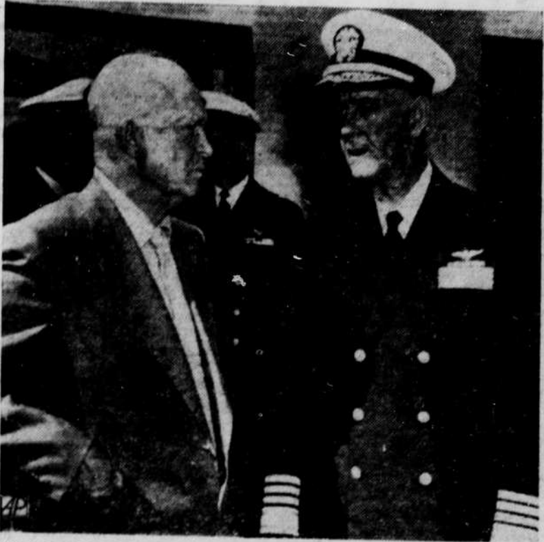
PRESIDENT EISENHOWER, looking very serious, gets first hand information on the Formosan situation from Adm. Felix Stump, Pacific Fleet commander at Augusta, Ga. Eisenhower interrupted his vacation at the Augusta National Golf course to see the admiral.