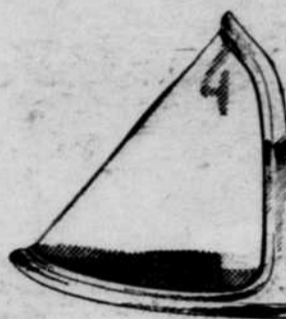
3 Sweep-Sight windshield