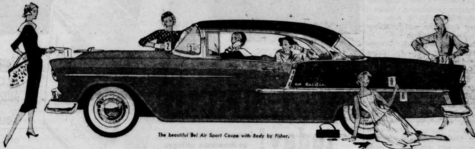
The beautiful Bel Air Sport Coupe with Body by Fisher.