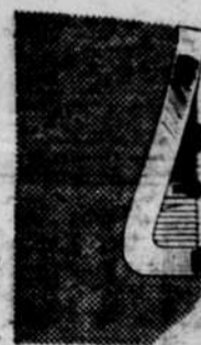
5 Fender-high taillights