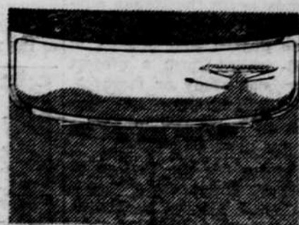
2 Lowered High-Level air intake