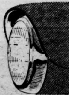
1 Visored headlights

STEALING THE THUNDER FROM THE HIGH-PRICED CARS!