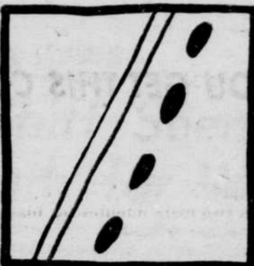
SKIER LOOKING FOR LOST SKI James U. Crouse Colorado State College