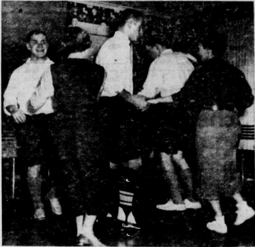
THE "COOLEST MEN" on campus were the Sigma Chi's as they appeared at a Wednesday night dessert with the Pi Phi's. Every member wore Bermuda shorts, complete with knee length socks.