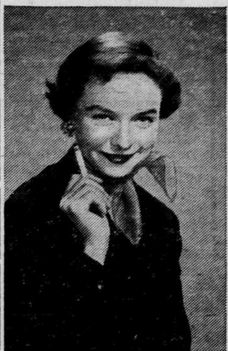
Actress Diana Lynn: This is the best filter of all—L&M's Miracle Tip. The smoke is mild, yet full of flavor.