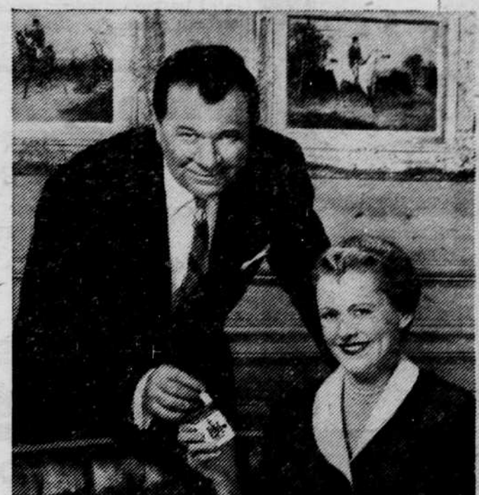
Mr. and Mrs. Stu Erwin, stars of TV's great "Stu Erwin Show": As we say on TV, this certainly is the Miracle Tip. L&M's filter beats 'em all.