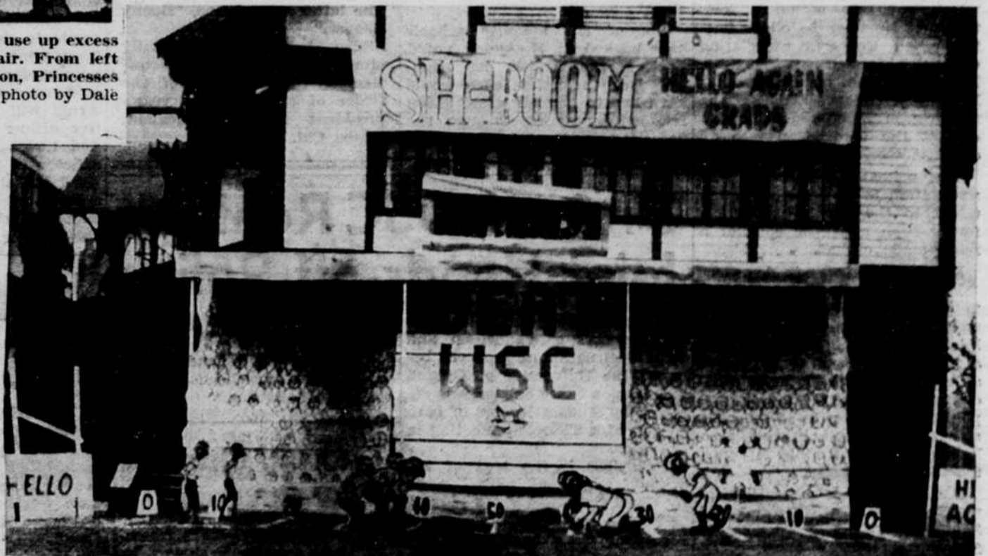
The most outstanding feature of Campbell club's winning sign was a mechanical card section which changed from "Beat WSC" to "Hello Alums" to the Oregon "O."