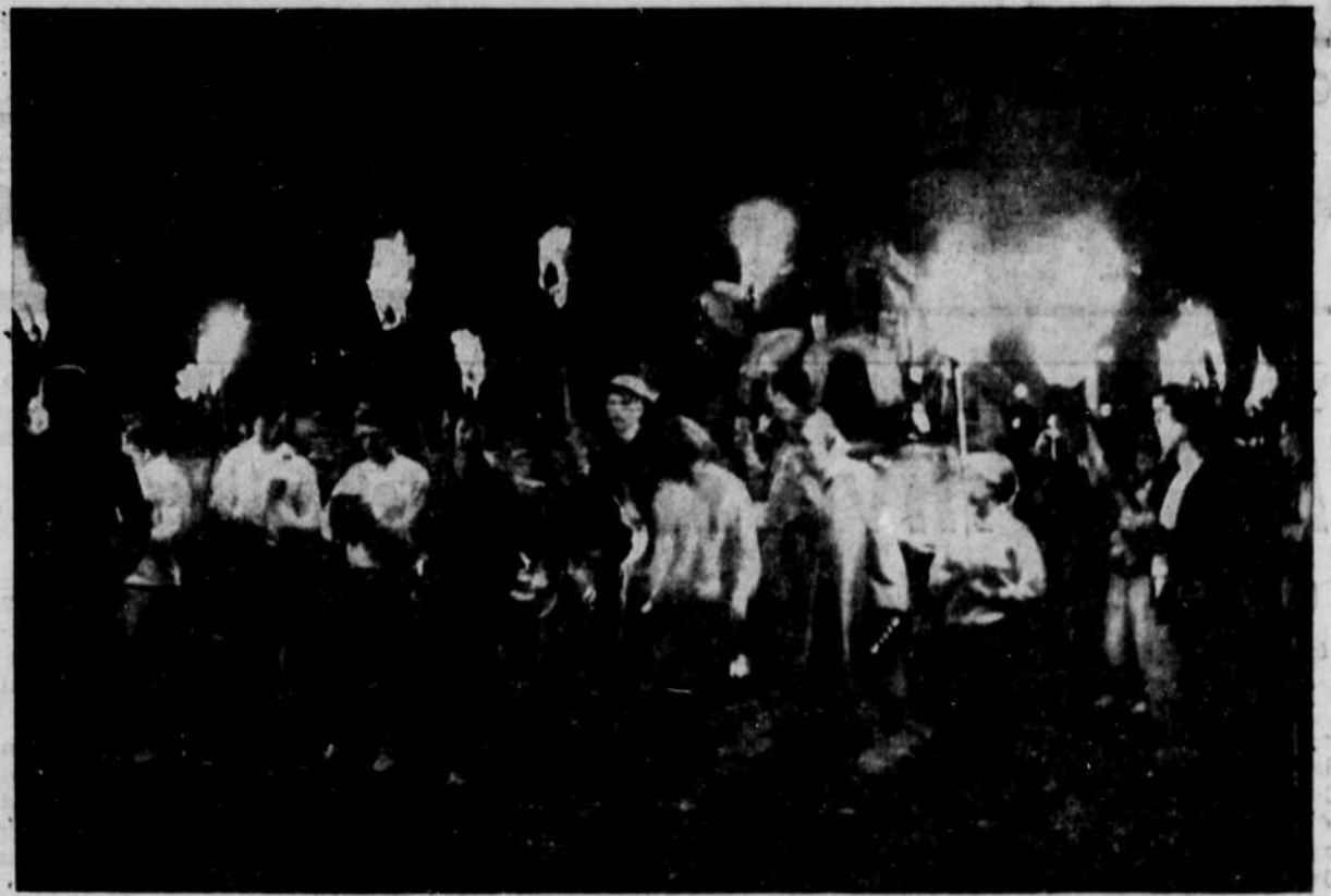
Torches light the way for the Carson 5-Campbell club parade entry in Friday night's pre-bonfire noise parade. Twenty-four separate creations rolled in the Friday night parade. Noise blared, blasted and crackled from every conceivable instrument including exploding gas, steam engines, air raid sirens and air horns.