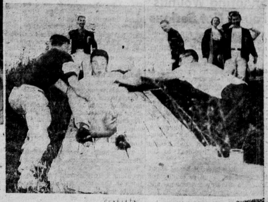
RIGHT. This freshman seems more worried about the splinters in the unblastable "O" than in whether he is doing a good job as paintbrush. Lettermen proctor this traditional Friday afternoon seat-of-pants painting of the "O."