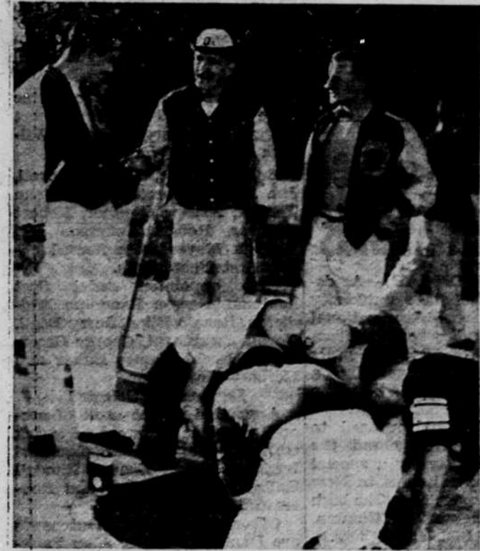
These lettermen give a Frosh's crutches a skeptical look. Other tradition breakers are hard at it scrubbing the seal. Actually the job was easy as a group of dorm freshmen already polished the seal with an electric buffer at 2 a.m. that morning.