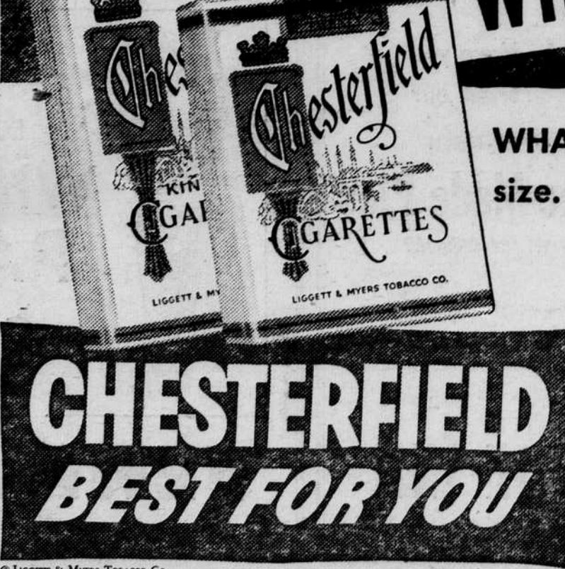
C LIGGETT & MYERS TOBACCO CO.

Sponsored by The Lane County Women's Republican Club, Assisted By The U. of O. Young Republicans