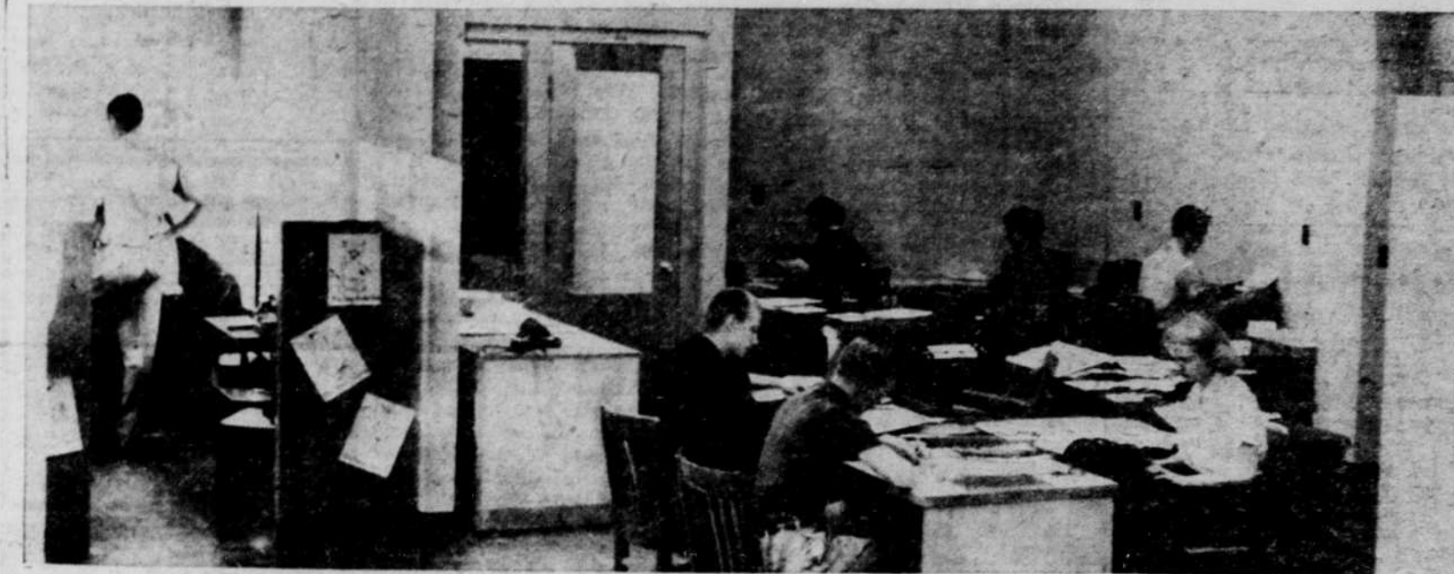
ALMOST TOO GOOD TO BELIEVE is the new, modern Emerald office on the third floor of Allen hall. Generations of past Emerald workers will find little resemblance to former Emerald headquarters located in basements and quonset huts. Included in the approximately 1500 square feet of floor space are the news and advertising departments and a semi-private editor's office (at extreme left in this picture). Door at rear leads to adjoining wire service room. Center right is news-copy-desk, with reporters at typewriters in rear. Column at extreme right conceals copy chute to University press in basement.