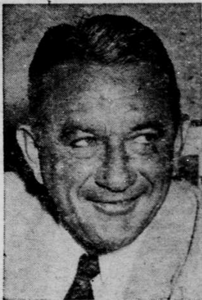
RED SANDERS Aiming for No. 1

A short note from UCLA, defending Pacific Coast conference champions, reveals that Coach Red Sanders has a big goal in mind for his team this year, even though they aren't eligible for the Rose Bowl, having played in it last New Year's Day. The goal? Number One in the nation.