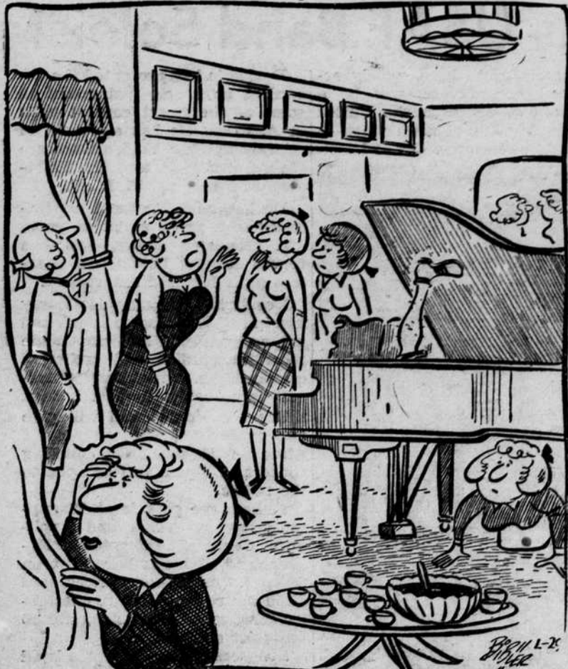
"Spread out carefully girls—no one saw him leave with the others."