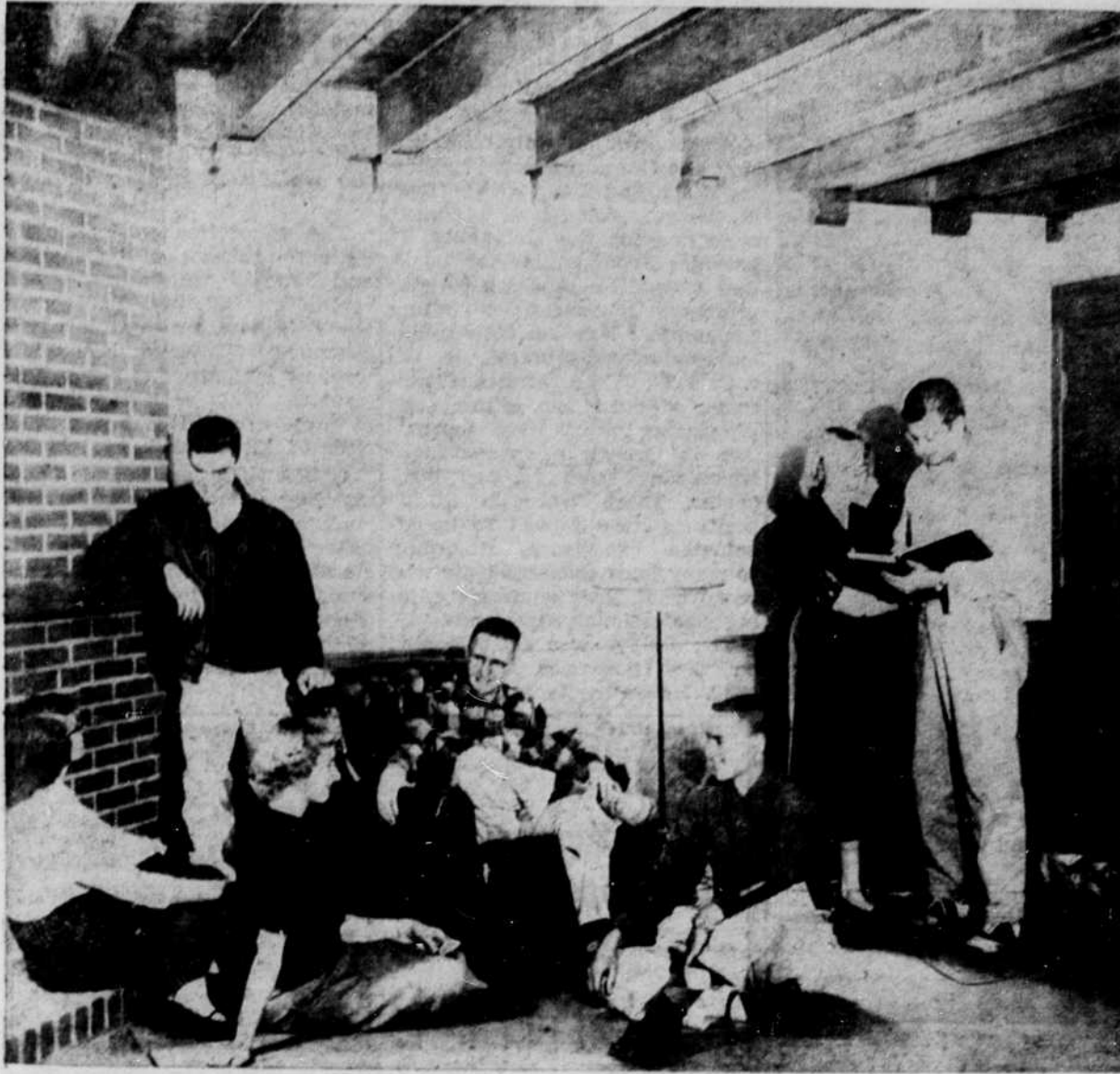
SHOW PLACE OF ALLEN HALL is the Eric Allen seminar room, a reproduction of Dean Allen's living room, where many of the early journalism courses at the University were taught. Located on the third floor of the new building, the Allen room was furnished with money donated by alumni and friends of the school of journalism. Included in the furnishings are floor lamps, end tables, television set, carpets and leather furniture. The windowless room has a corner fireplace, built-in book shelves beamed ceilings, stained wood paneling and oak parquet floors. An oil portrait of Dean Allen, painted by David McCosh, associate professor of art, from photographs of the late dean will be on display in the room, which is to be used for graduate and senior class and as a meeting place for campus journalism groups.