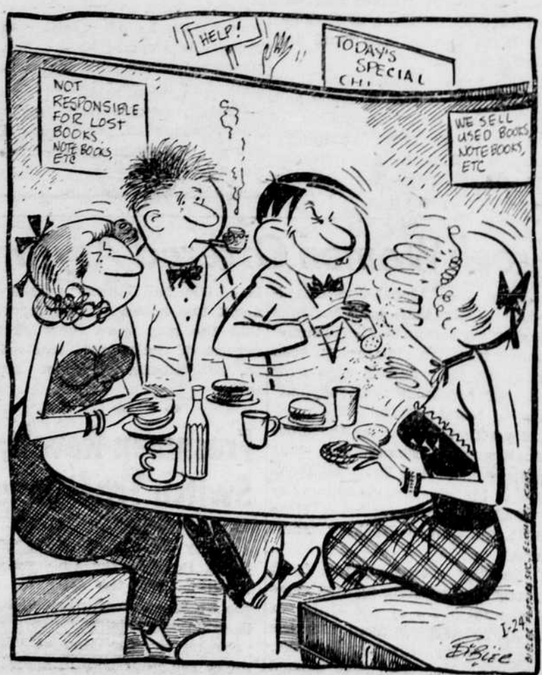
"Not so much pepper, Worthal, Not so—Aa-much—Ah-ha-pep-ah—"