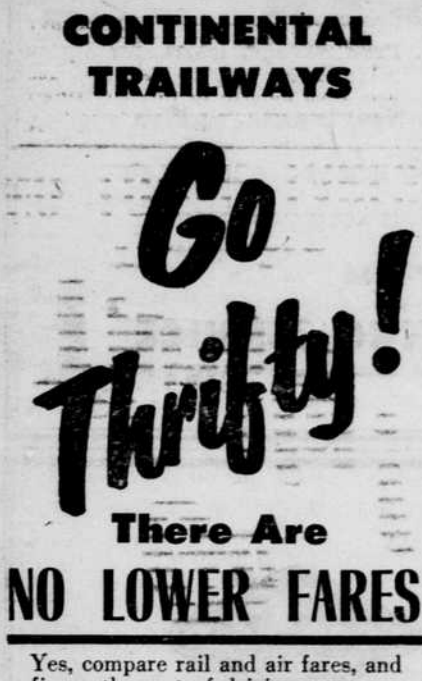
figure the cost of driving your own car . . . then see for yourself how much you save on Continental Trailways!-