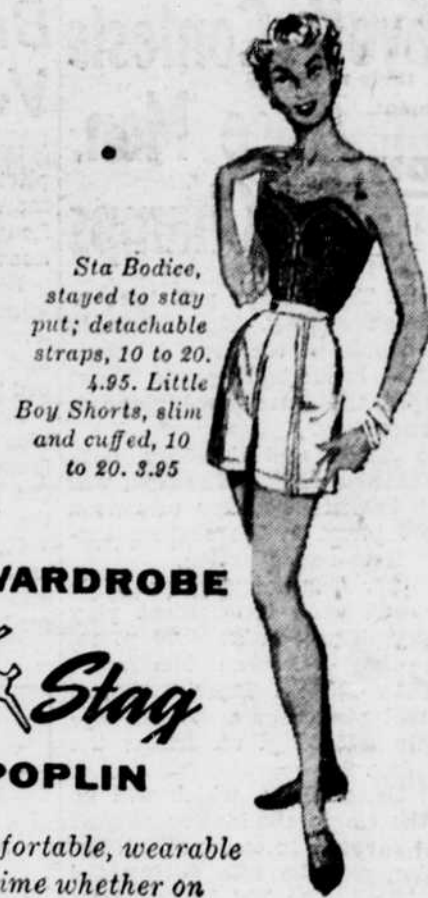
Sta Bodice, stayed to stay put; detachable straps, 10 to 20. 4.95. Little Boy Shorts, slim and cuffed, 10 to 20. 3.95