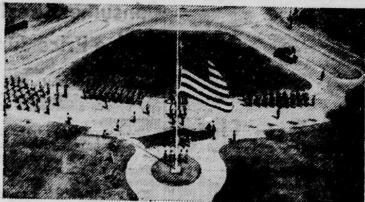
1. Pilot training begins at Lackland Air Force Base, where Aviation Cadets get 3 months of officer indoctrination.