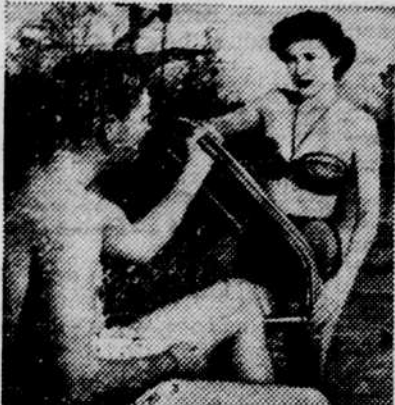
2. It's a hard grind, but Cadets also find time to relax.