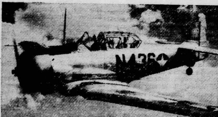
3. In primary training the Cadet flies his first planes, a Piper Cub, and this T-6. Later he will fly the more advanced T-28.