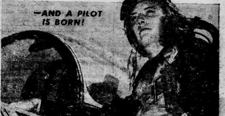
7. He's tested those silver wings... And won the respect and admiration that go to every jet pilot in the United States Air Force! From now on he'll rule the skies in an Air Force jet.