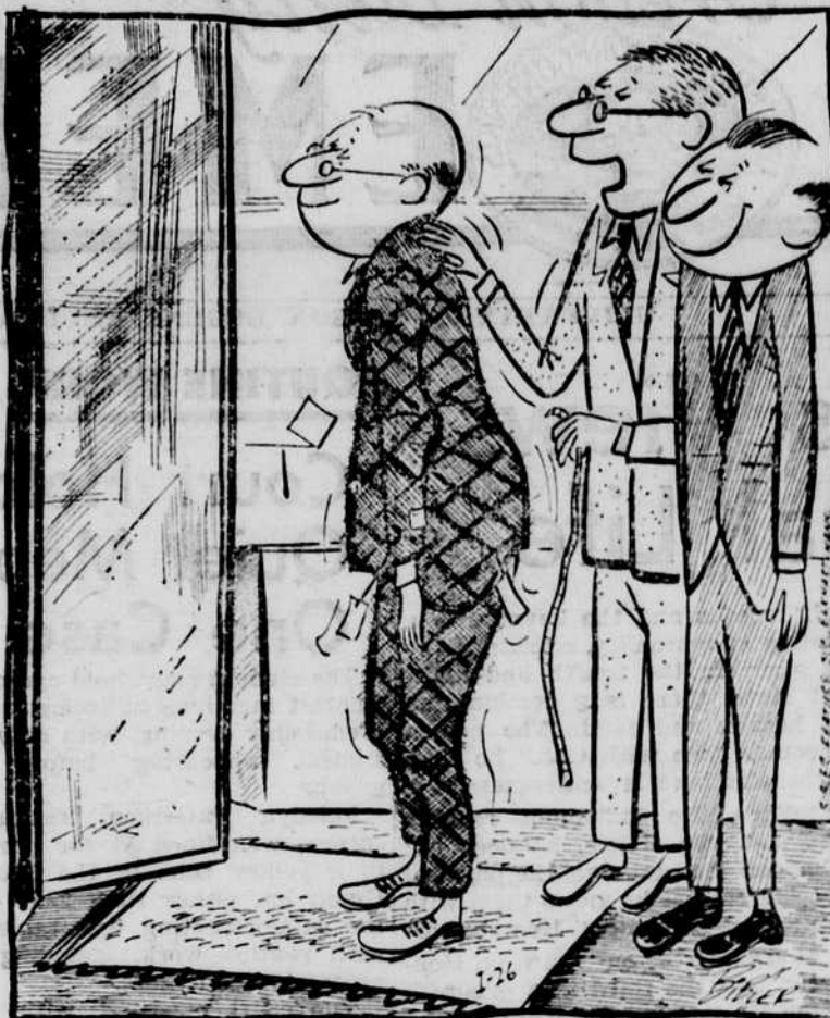
"It's a material quite popular with the faculty, sir—A tweed is supposed to look baggy."