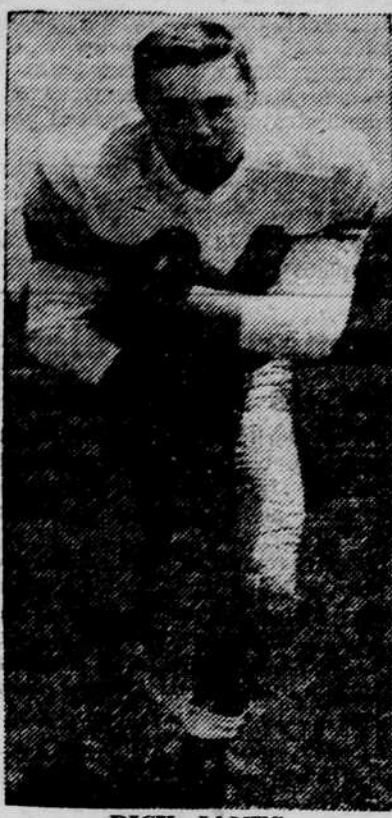
DICK JAMES Interception Ices Game

the four minute rule went into effect and threw six straight passes, three of them completed.