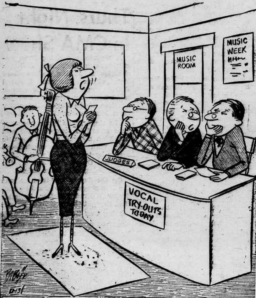
"Sings like a bird, wouldn't you say, professor?"