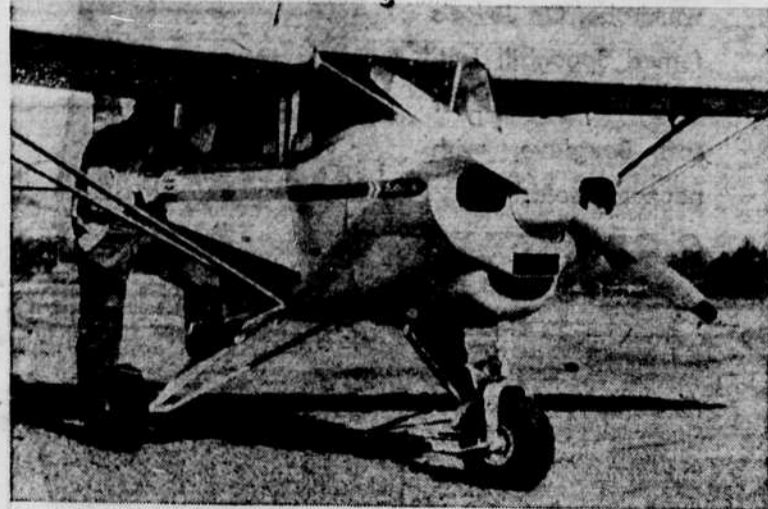
Piper Tri-Pacer "53" Model. Fred Savage, instructor

NOW - Sign up for Our New Installment Plan