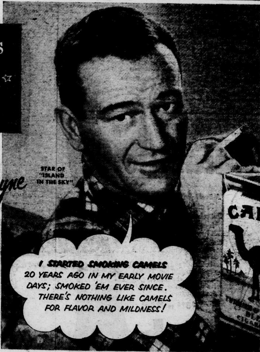
STAR OF "ISLAND IN THE SKY"

John Wayne says: "My college football coach got me a summer job at a movie studio. I started as a prop man and stunt man. Afterward my studio friends inveigled me into acting. I made about 75 Westerns before big parts came my way.