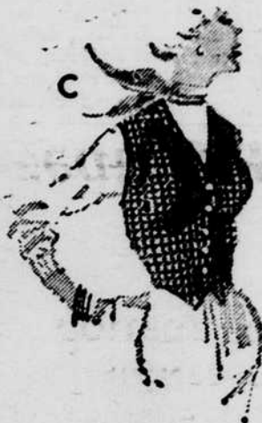
C. Checked knit vest to match cardigan in same color combinations. With glowing gold buttons. Sizes 10-18...$7.95