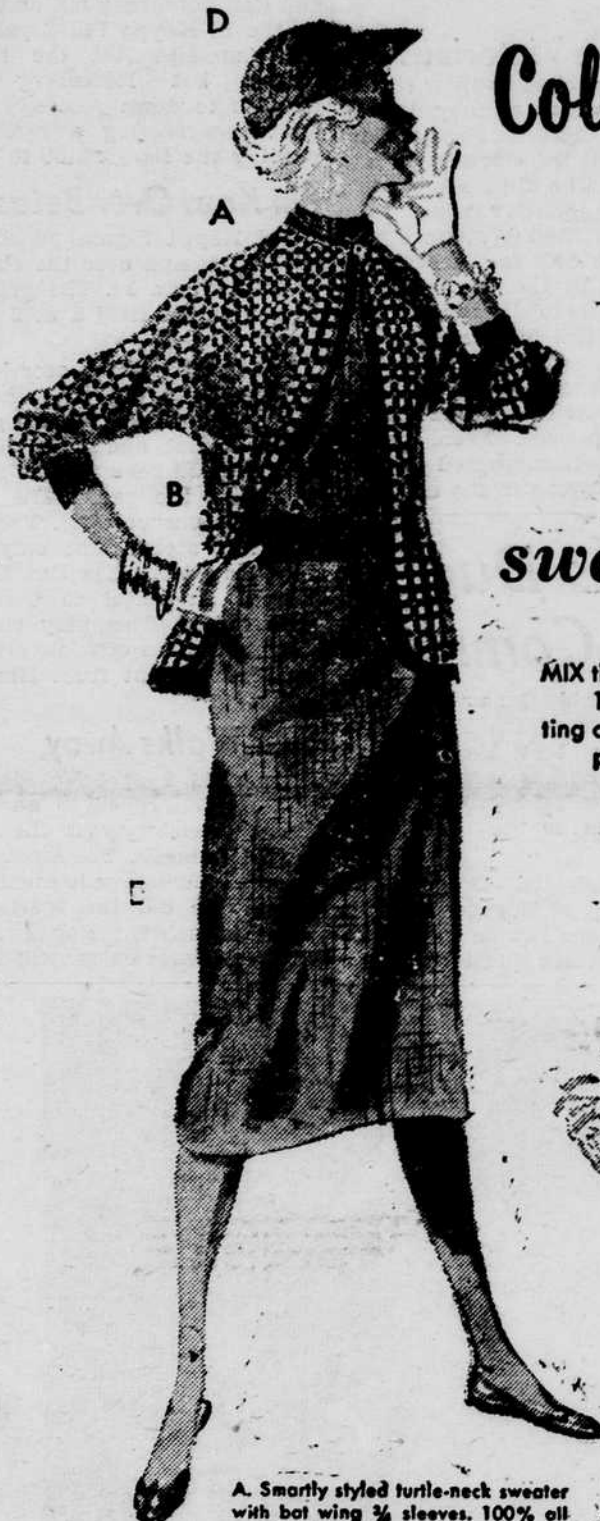
A. Smartly styled turtle-neck sweater with bat wing 3/4 sleeves. 100% all wool zephyr in nutmeg brown, paprika, sage green. Sizes 10-18...$5.95

MIX their colors...MATCH their colors...MULTIPLY your campus wardrobe with these 100% wool separates! You'll simply live in these wonderfully textured, smart-fitting co-ordinates in their perfectly dyed-to-match spicy fall tones... Here is luxury at a price—COLLEGE CASUALS gives you a revolving wardrobe to suit college budgets!