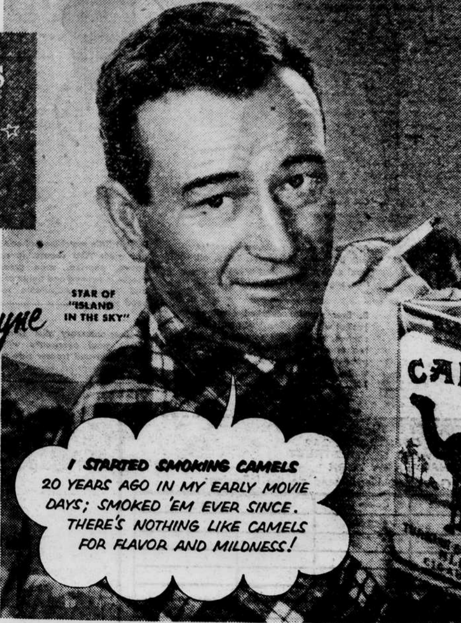
STAR OF "ISLAND IN THE SKY"

I STARTED SMOKING CAMELS 20 YEARS AGO IN MY EARLY MOVIE DAYS; SMOKED 'EM EVER SINCE. THERE'S NOTHING LIKE CAMELS FOR FLAVOR AND MILDNESS!