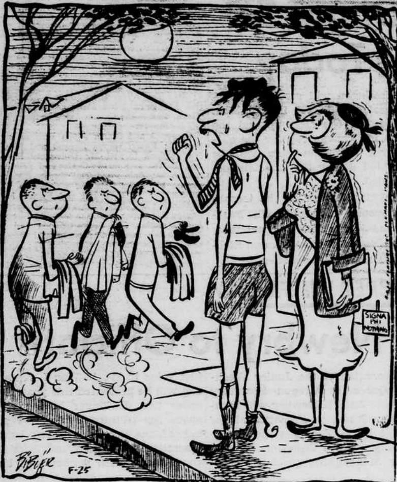
"Well, now, I suppose you guys have never borrowed any of my clothes."