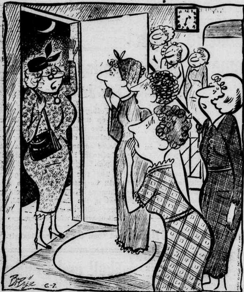
"Now I suppose you girls think you can give ME one of your silly week-end campuses."