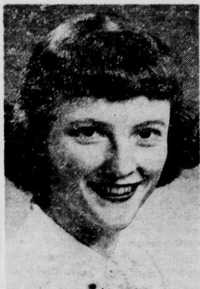
SARAH TURNBULL AWS President

Composed of representatives from each living organization is the AWS congress under the jurisdic-