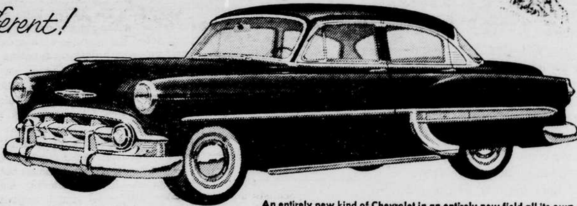
An entirely new kind of Chevrolet in an entirely new field all its own

The glamorous Bel Air Series for 1953 is truly a new kind of Chevrolet. Four new Bel Air models—4-Door Sedan, 2-Door Sedan, Convertible, Sport Coupe—create a wonderful new class of cars.