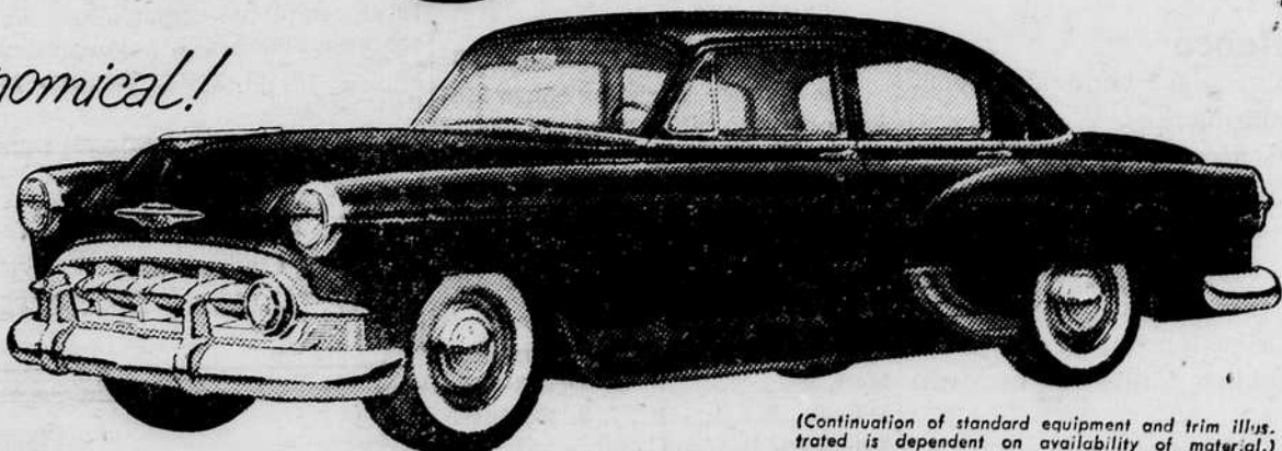
(Continuation of standard equipment and trim illustrated is dependent on availability of material.)

Smart new Chevrolet styling and advanced features! Five models include the 4-Door and 2-Door Sedans, Club Coupe, Business Coupe, "One-Fifty" Handyman.