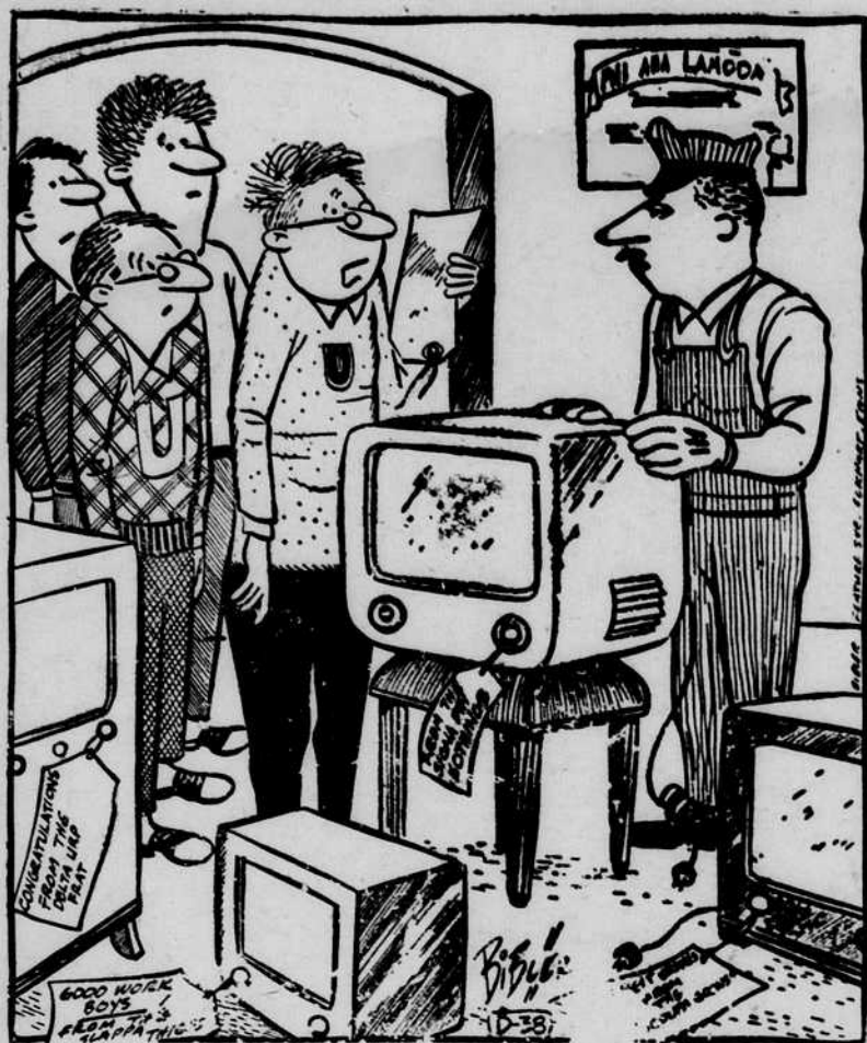
"Dear Friends: Congratulations to your fraternity for taking top scholastic honors this year; heard you didn't have a TV set—please accept this slightly used one as a reward for such outstanding—"