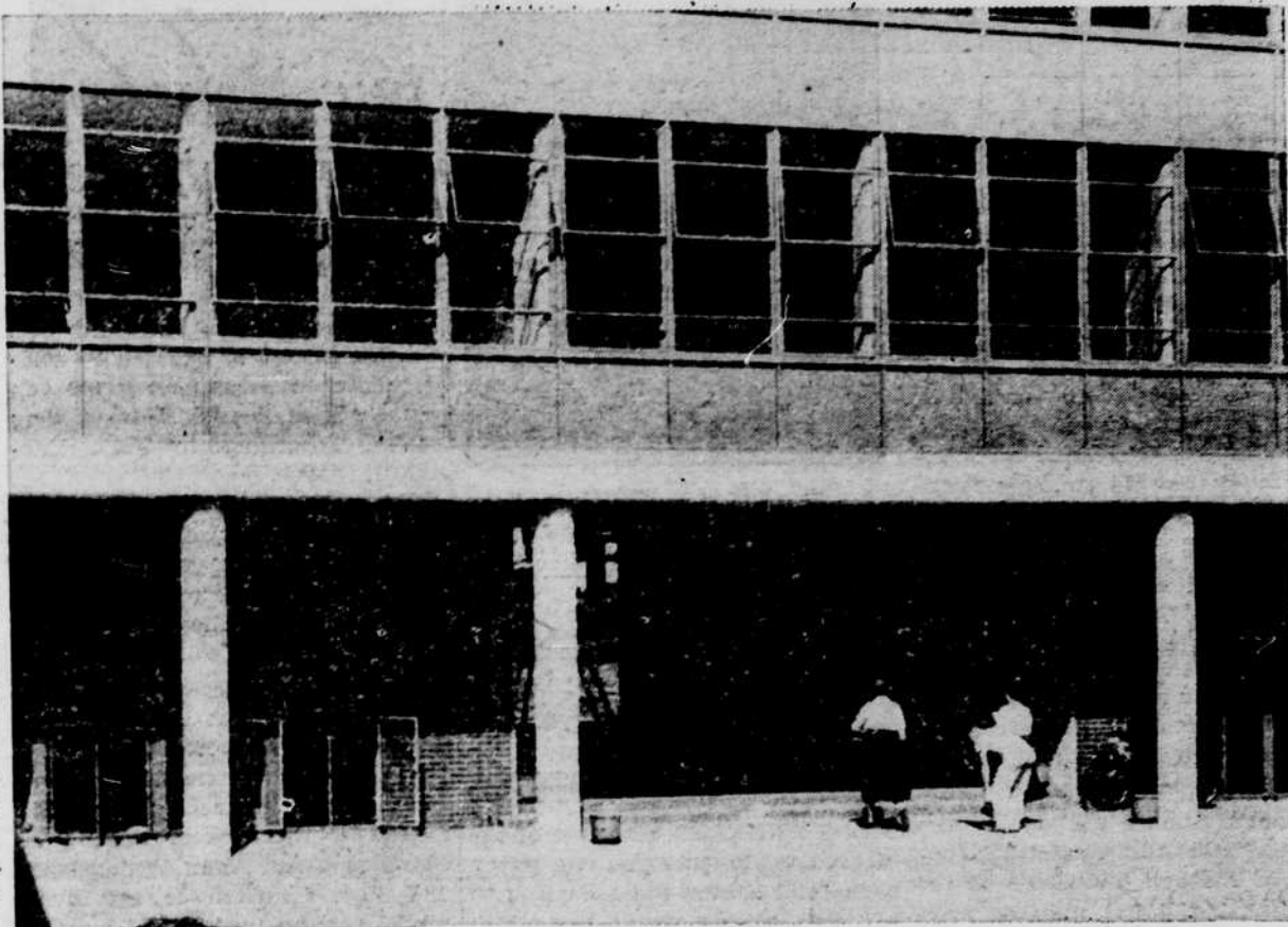
NEW BUILDINGS in 1952 included Science, which opened "for business" spring term, and Commonwealth (above, which was ready fall term of the 1952-53 year. Actual dedication of the new science building, which houses physics, chemistry and biology, was held April 25 and 26. Commonwealth, which includes remodeled Oregon and Commerce halls and the new wing joining them, houses business administration, political science, economics, history and sociology. Other building accomplishments in '52 included remodeling on Johnson hall and Deady hall (not yet completed), remodeling on architecture and allied arts, and new showers in men's physical education.