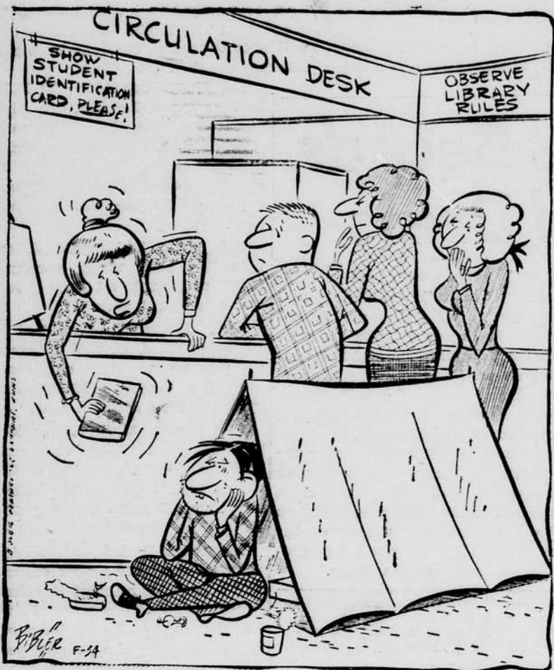
"Here's the book you requested, sir—it just came in."