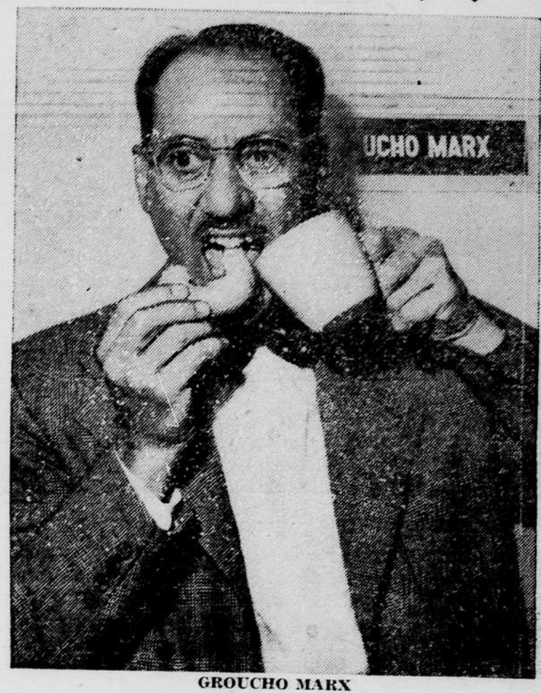
"Humor-from Silent Films to TV"