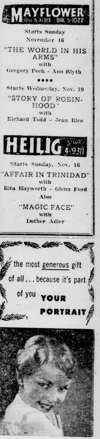
Be generous to those dear ones of yours-have your portrait made for Christmas-NOW!

The University of Santo Domingo, in the Dominican Republic, West Indies, is the oldest university in the New World. It was authorized by papal bull in 1538.