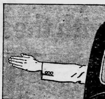
• Left turn, pulling away from curb, or backing up