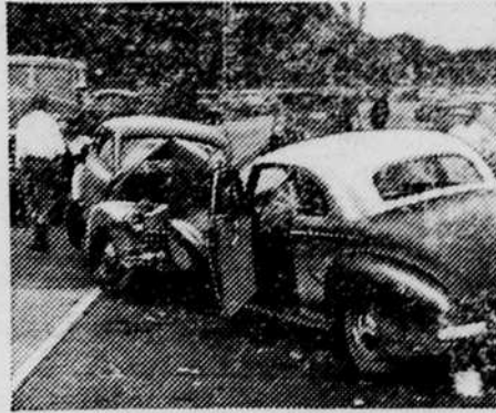
Out of line, in trouble! Rushing during rush hours never pays off. Don't insist on your right of way and risk your neck. Give the other guy a break. Chances are greater you'll get home safely for supper.