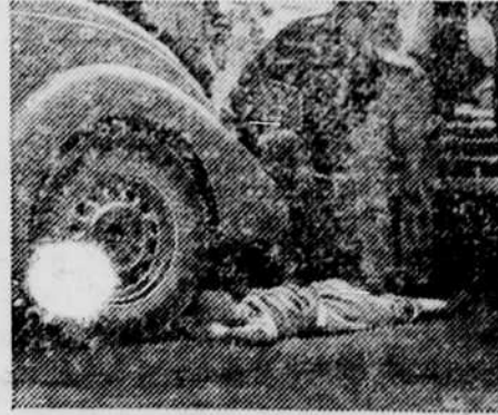
Did you know this lad? Maybe he was your boy, or your son's playmate. A speeding car caught him as he darted out between parked cars. Drive with extra caution, and keep an eye out for youngsters—always!