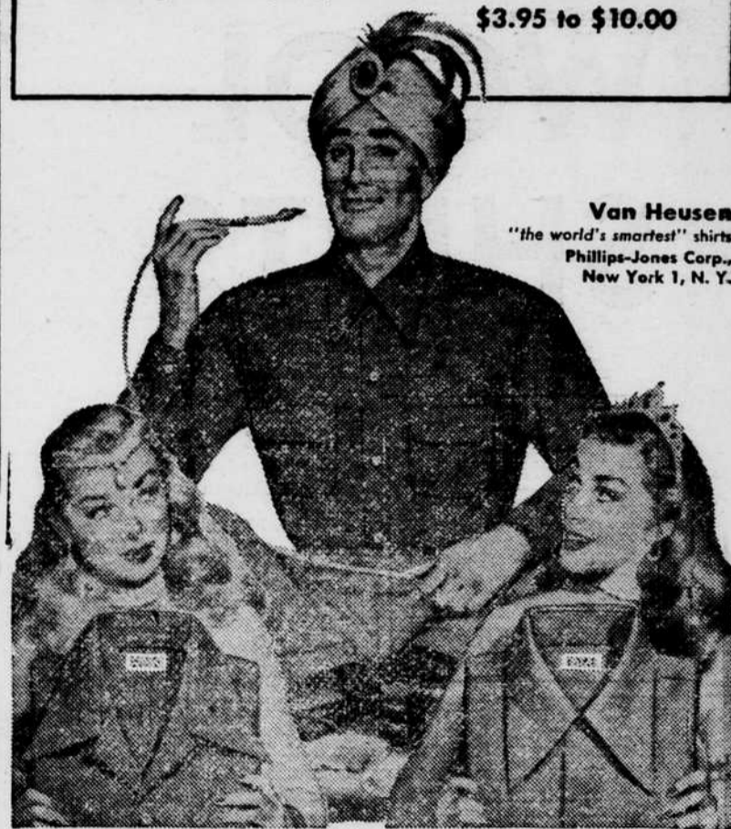
Van Heusen "the world's smartest" shirts Phillips-Jones Corp., New York 1, N. Y.