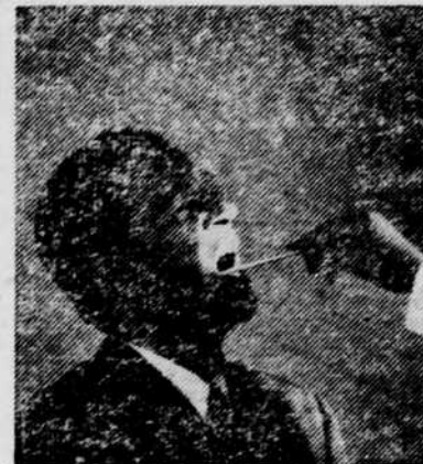
Doctors warn smokers about throats. Kaywoodie Pipes have Three Throat-Guards to give extra throat protection.