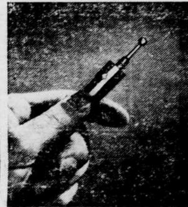
SECOND THROAT-GUARD: Exclusive, patented "DRINKLESS" device. Cuts down irritating tars... keeps every pipeful lit longer.