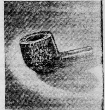
THIRD THROAT-GUARD: World's best imported briar. It's specially heat-resistant and porous. Makes smoke cooler...less irritating.