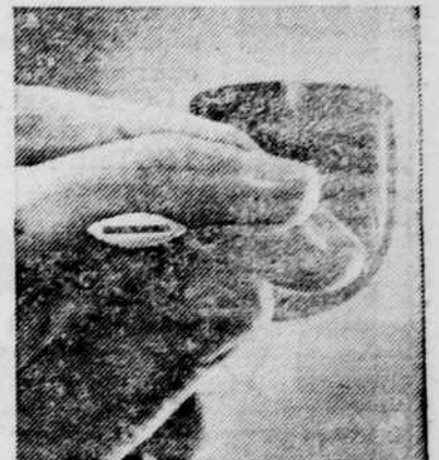
FIRST THROAT-GUARD: "Wider-opening" bit. Spreads out smoke, helps cool it. No hot smoke to irritate throat or "bite" tongue.